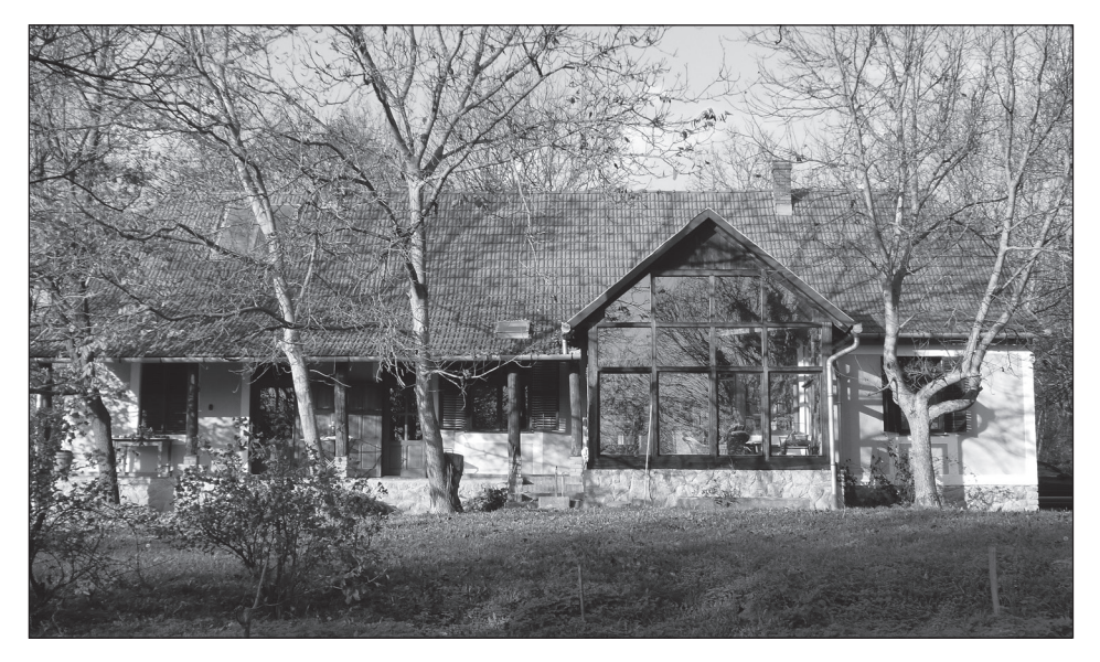
Figure 6. Dióliget. Passive solar house at Gyűrűfű, Hungary, 2014.

such as home-computing, teleworking, etc. In geography, traffic is also a form of communication. Traffic is a technique used to conquer space, and virtual communication is a logical advancement of such a technique. In the fifth round of such techniques designed to overcome large distances since the Industrial Revolution, after the steamboat, the railway, the electric grid and the highway networks, these days the transmission of data and information seems to be – at least theoretically – more important than physical transportation of goods and passengers (ERDŐSI 2004:25).