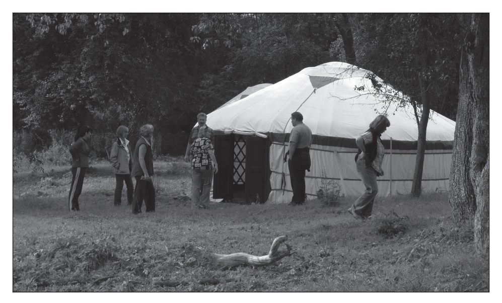
Figure 2. Visitors at one of the Yurts, Gyűrűfű, Zselic, Hungary, 2013.

energy consumption, reproduction, etc. – will be restricted through negative feedback. Feedback has a lag time, which may result in the appearance of periodical fluctuations (such as predator-prey population sizes). However, periodical features can be controlled by lag time regulation only (BORSOS 2016).