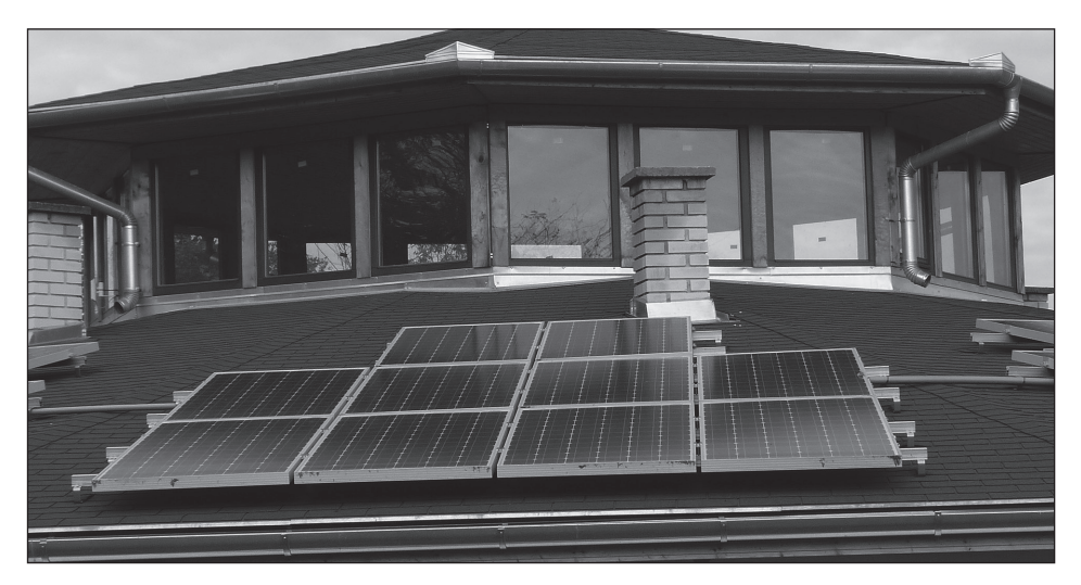
Figure 5 . Photovoltaic cells on the roof of the Community House, Gyűrűfű, Zselic, Hungary, 2014.