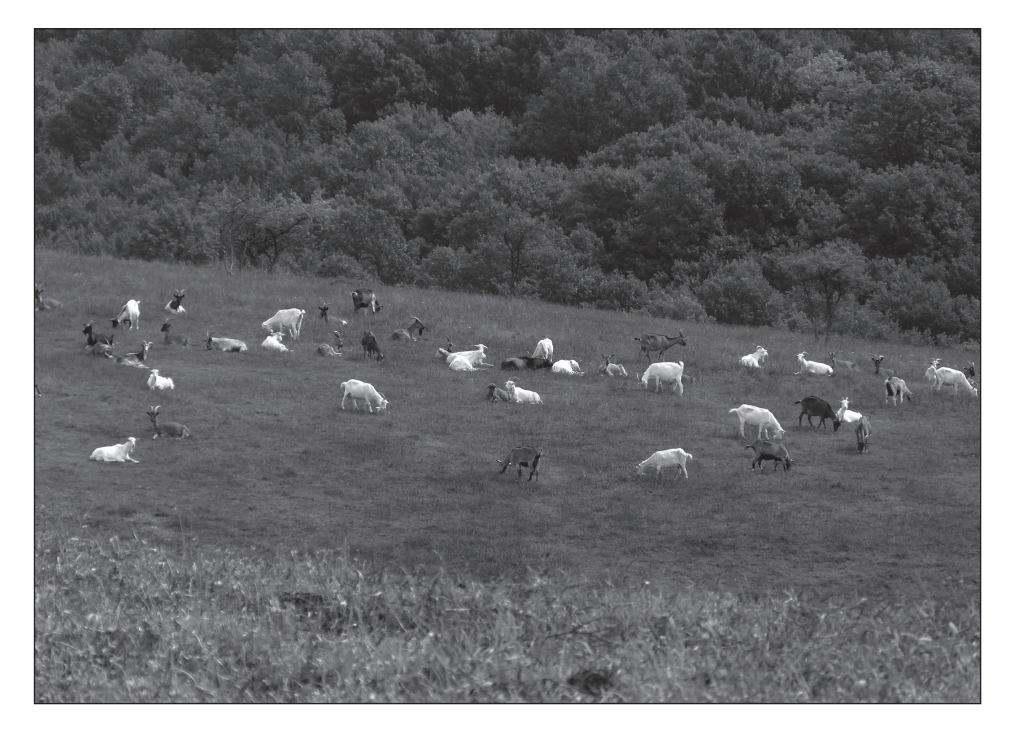
Figure 4. Goats on pasture at Gyűrűfű, Hungary, 2013.