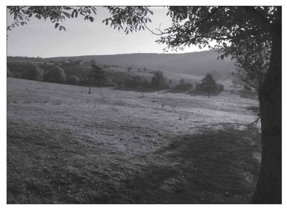
Figure 3 . Wood pasture on the eastern hillside of Gyűrűfű, Zselic, Hungary, 2013.

the wealth of the natural environment was quite conscious (ANDRÁSFALVY 2009). For instance, this was accomplished for centuries by the land use patterns and water governance practices in the Tisza valley (BORSOS 2014).